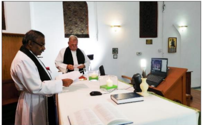
Worship during the pandemic at St. Christopher’s Cathedral, Bahrain. Note the laptop on the lectern.

Words like “unprecedented” seem too small to describe the impact of the COVID-19 pandemic, which has sorely afflicted the lives of millions of people around the world. It is hard to get one’s mind around the impact of this crisis. And yet, for many Christians in the Middle East, the pandemic is just one more crisis to add to the list.